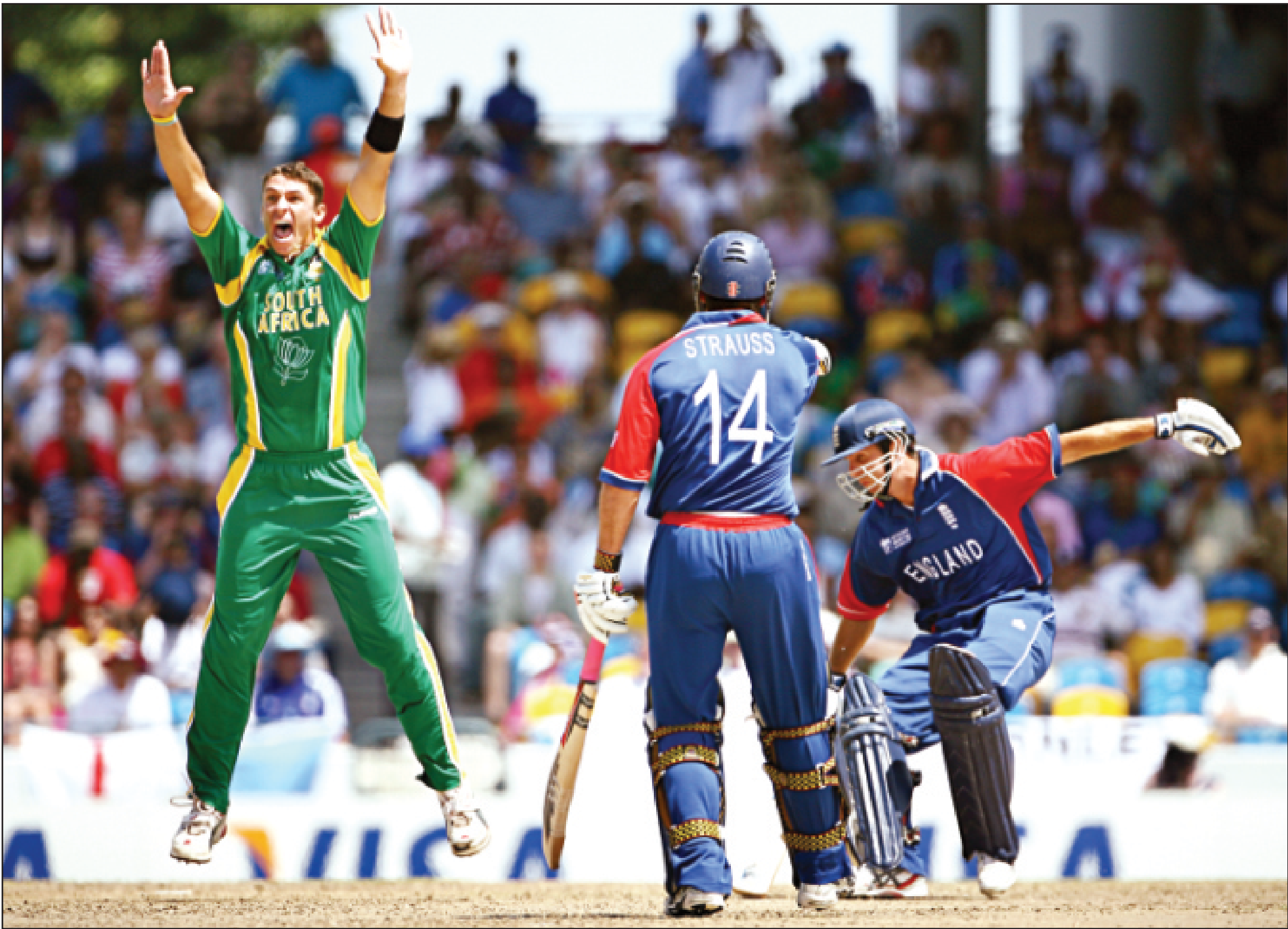
South Africa paceman Andre Nel (L) appeals successfully for an lbw decision against England captain Michael Vaughan (R) during the World Cup Super Eights match at the Kensington Oval in Bridgetown, Barbados yesterday.

"I've been trying to think of something else so I thought I'd try a Freddie and point to the sky."