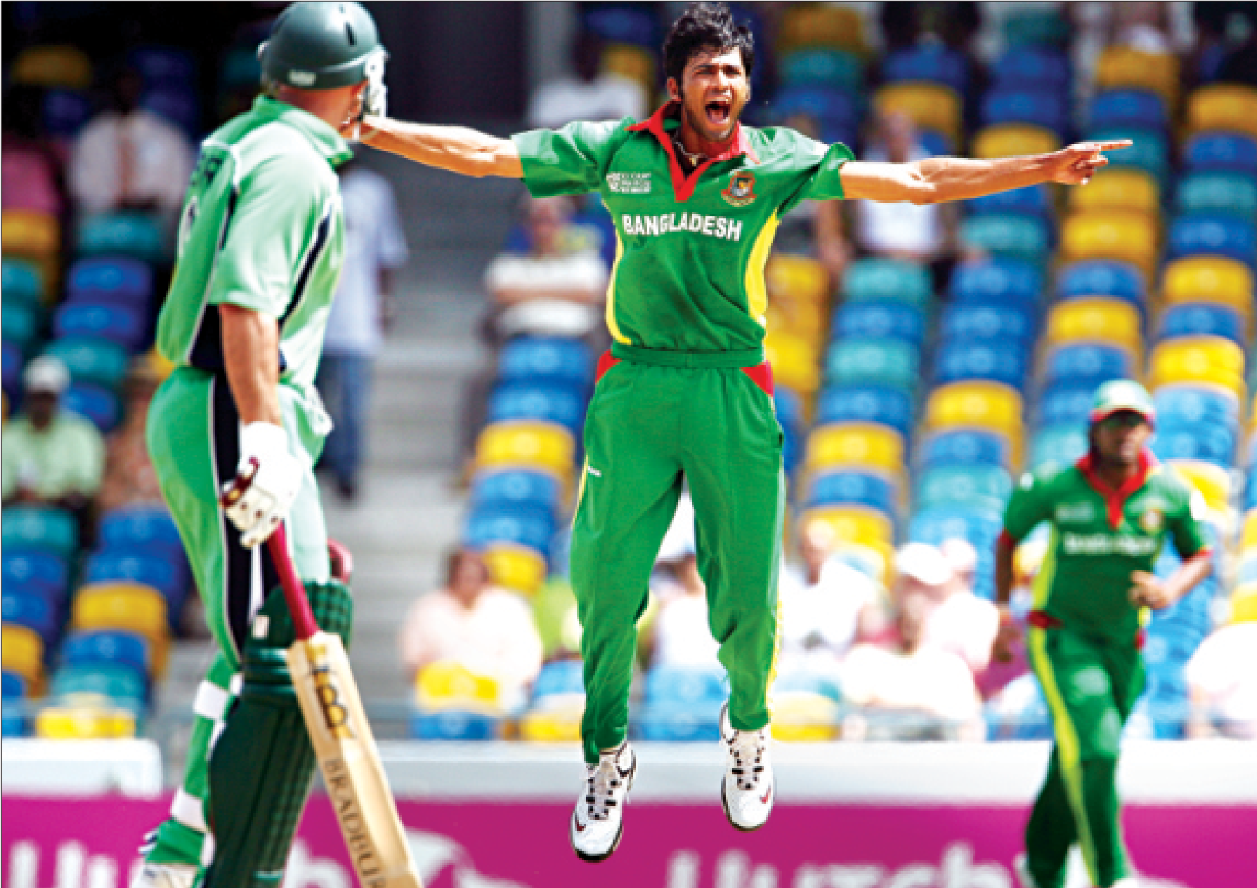
Bangladesh paceman Shahadat Hossain (C) unsuccessfully appeals for an lbw against Ireland during the World Cup Super Eights match at the Kensington Oval in Bridgetown, Barbados yesterday.