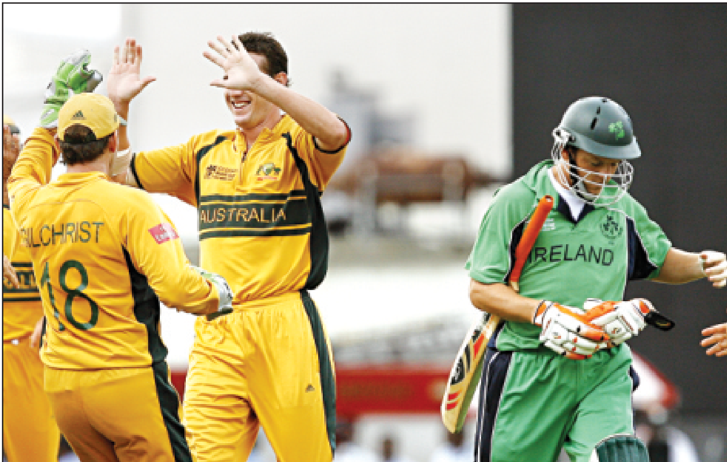
Australia fast bowler Shaun Tait (C) exchanges high-fives with teammates after taking the wicket of Ireland batsman Niall O'Brien (R) during their World Cup Super Eights match at the Kensington Oval ground in Bridgetown on Friday.