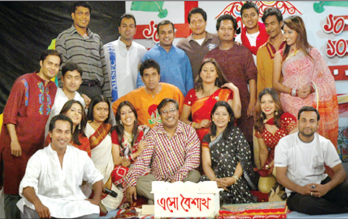
A scene from Esho Baishakh

At 6:00am Channel i will air Chhayanat's Baishakhi celebrations live from Ramna Park. At 9:45am a special episode of the popular talk show, Tritimatra will be telecast. At 12:30pm a special episode of Citycell Tarokakathan will be aired. Bangla feature film Shajghor , based on a literary