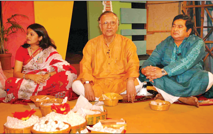
A scene from Baishakher Adda

From 6:00 to 8:30am ATN Bangla will air Baishakhi celebrations live from Rabindra Sarobar, Dhanmondi. At 11:10am Elorey Baishakh , a dance