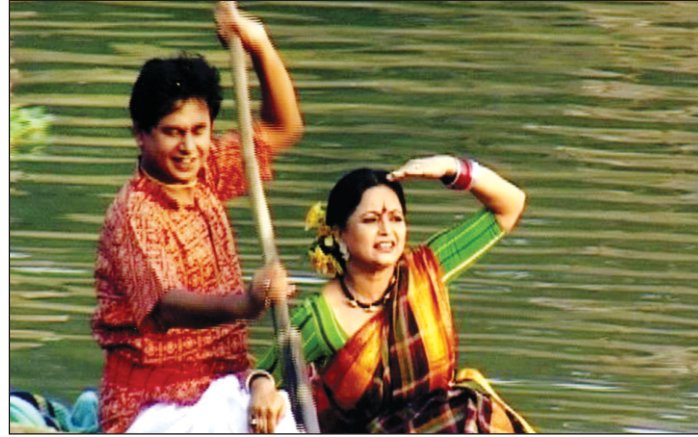
A scene from Shonai Madhob

At 2:00pm Loko Utshob will be aired. At 8:30pm Dhruamel , a programme