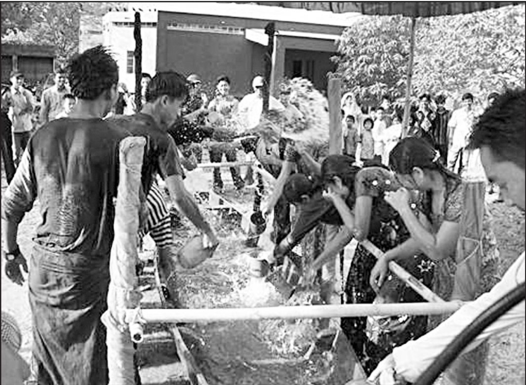
Indigenous boys and girls spray water to each other at a festival in Rangamati held yesterday as part of a three-day celebration to welcome the Bangla year 1414.