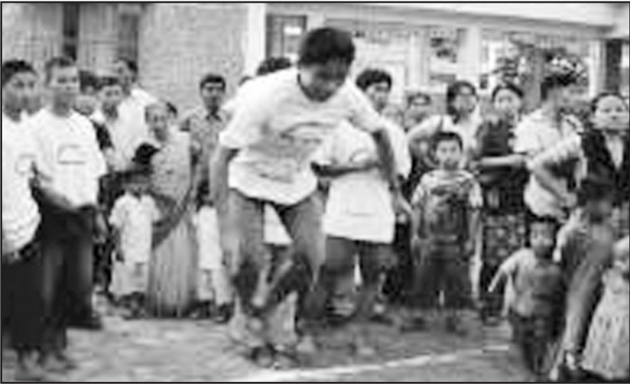
Indigenous youths display their skill at a traditional ghila khela (a sport using bamboo sticks), left, while elders play a long flute to kick-off celebrations to welcome Bangla year 1414 at the Tribal Cultural Institute in Khagrachhari town yesterday.