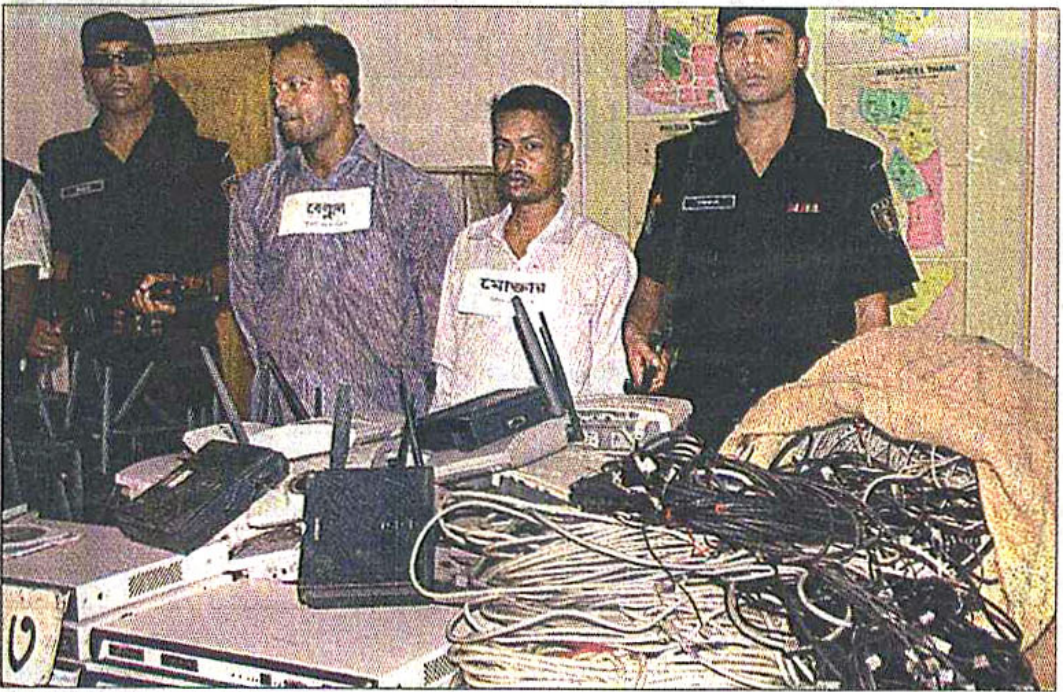
Rapid Action Battalion personnel arrest two people and seize a huge cache of equipment for running illegal VoIP business at a house in East Bashabo in the capital yesterday.