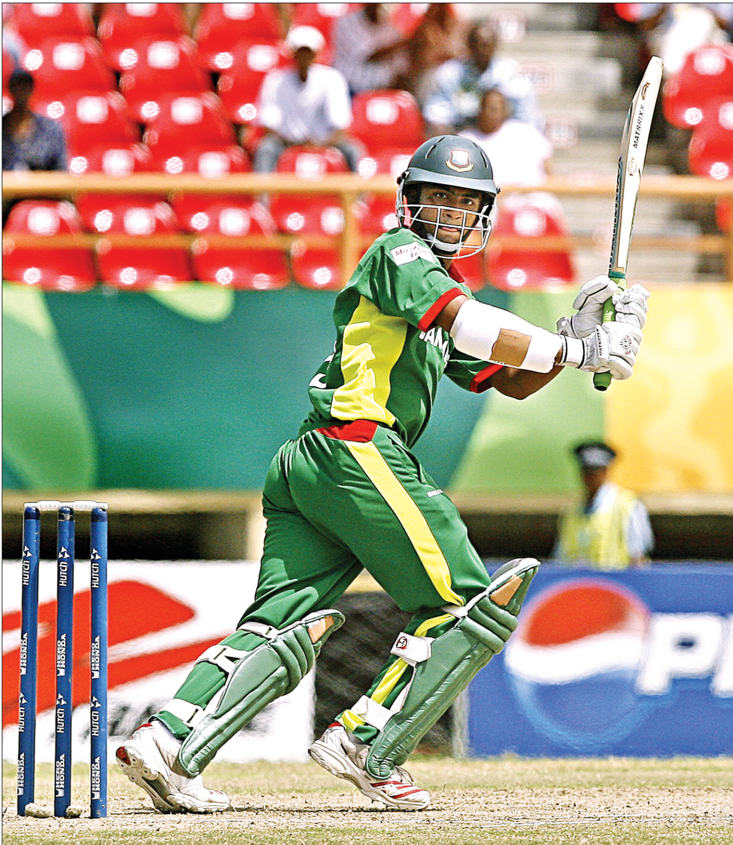
Bangladesh opener Tamim Iqbal plays the ball towards fine-leg during the World Cup Super Eights match against South Africa at the Guyana National Stadium in Georgetown on Saturday.

Dhaka Abahani and Sheikh Russell share the top slot with 11 points, both playing five matches.