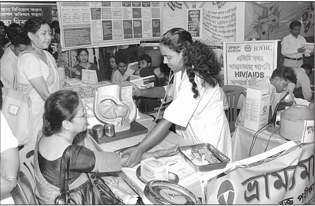
A health worker measures blood pressure of a woman at a stall at an exhibition of medical equipment at the Osmani Memorial Hall in the city yesterday. The Ministry of Health and Family Welfare organised the exhibition marking the World Health Day.