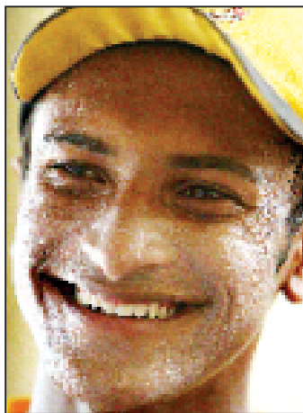
SHAKIB AL HASAN

Hasan said he has watched every South African bowler on