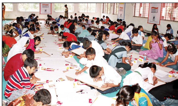
Youngsters participate in the competition

Social Marketing Company (SMC) organised a children's painting contest recently at Shishu academy, according to a press release. The event was held on the occasion of World Health Day (today, April 7). The event was a colourful occasion with hundreds of young ones participating and was sponsored by Orsaline-N and Orsaline Fruity, SMC's flagship brands.