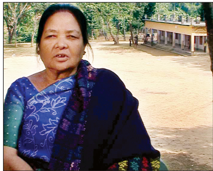
A scene from the docu-magazine

lated. So, for the existence of their identities, languages of these ethnic groups should be preserved."