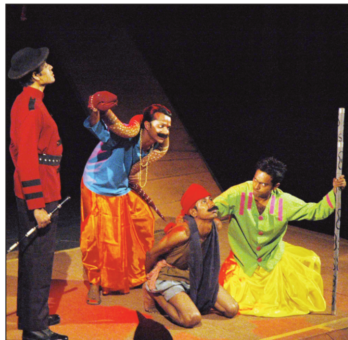
Actors of Palakar in Mangula

Performed by Bengali actors, chronological history of oppression on the Hajong community has been presented in the play. The minority group living by the river Sumeshwari in Netrokona, has a long history of struggle for existence and securing rights. Many lives have been sacrificed in the struggle against feudal lords and the British Raj. Under Moni Singh's leadership, Beo (weaving) -- the only means of their livelihood, becomes the most important instrument of their resistance. Even in dire straits, the Hajongs continue their struggle.