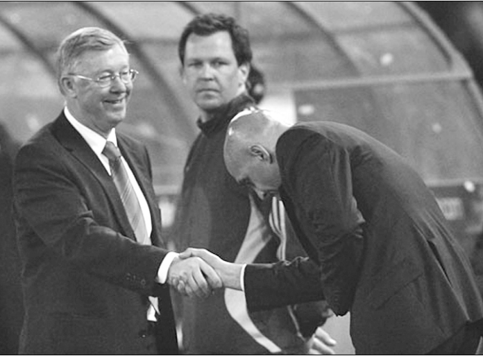
AS Roma coach Luciano Spalletti (R) bows in respect as he shakes hand with Manchester United counterpart Alex Ferguson before the start of their Champions League quarterfinal at the Stadio Olimpico on Wednesday.