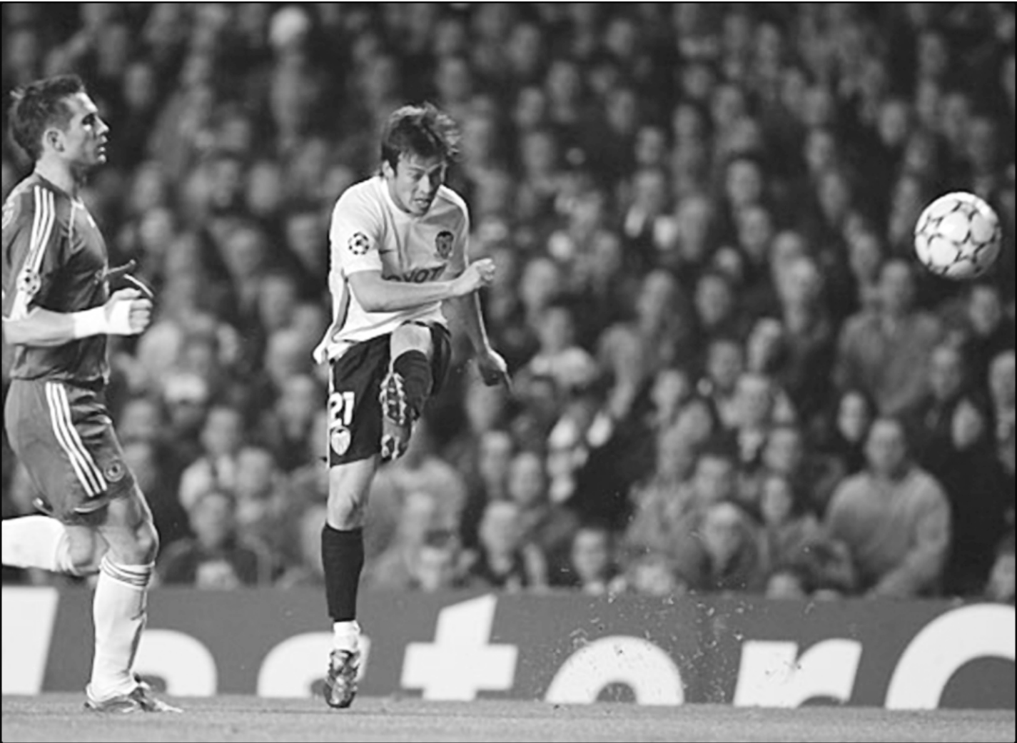
Valencia midfielder David Silva (R) lets loose a thundering 30-yard effort to score against Chelsea in the first leg of their Champions League quarterfinal at Stamford Bridge in London on Wednesday.