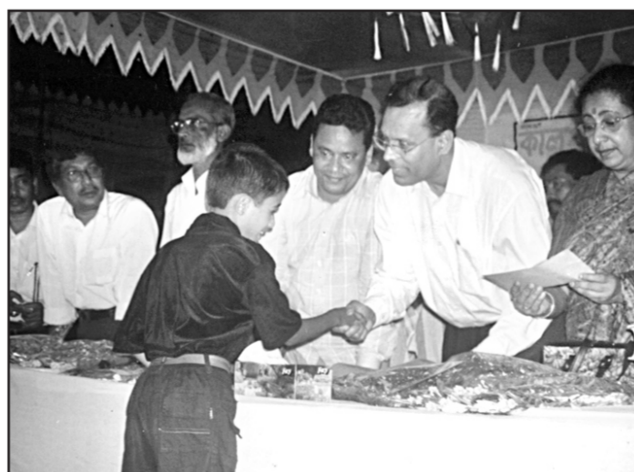
Stipends to 42 meritorious students of 16 schools in Sonaimuri upazila in Noakhali district, given by a local philanthropic organisation, were distributed at a function held at Kaluai Model School recently.