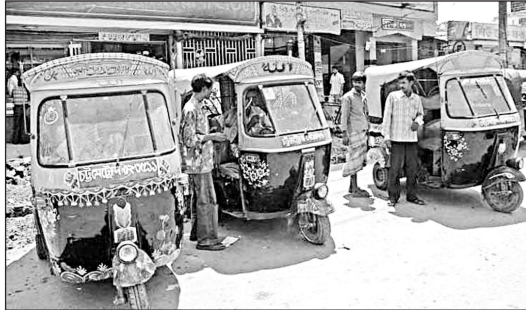
Two-stroke tri-wheelers continue to ply the streets of Chittagong city defying a ban as well as the law enforcers.

The women ward commissioners also accused the Mayor of defying the order of LGRD ministry issued on June 15, 2005 asking him to implement the HC verdict.