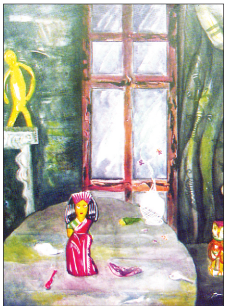
Samples of paintings on Ibsen by Bangladeshi artists

This endeavour creates a cultural bridge