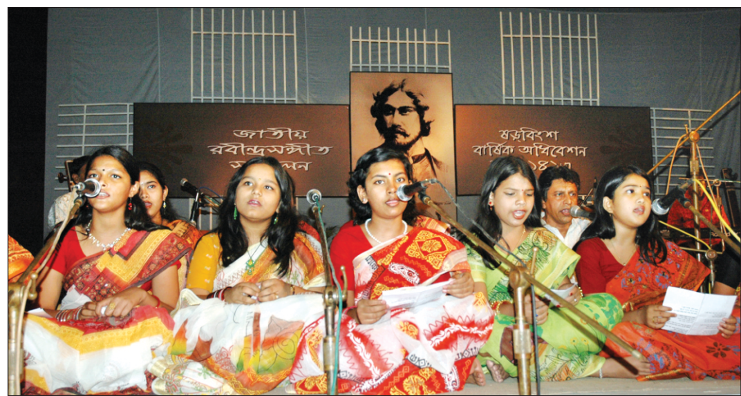
Artists of Jatiya Rabindra Sangeet Sammilan Parishad perform at the programme