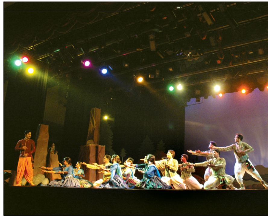
A scene from the dance-drama