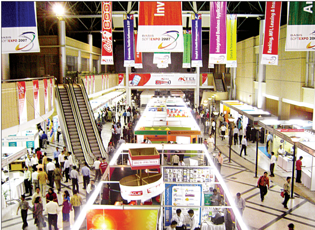
Visitors browse through the main exhibition area of SoftExpo 2007, top, (below from left), an employee of Visual Magic Corporation Limited (VMCL) demonstrates the Alphabet Talking Book for children while AIUB students exhibit their projects and the Currency Checker by VMCL.