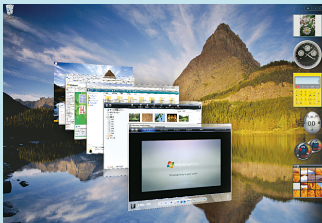
A screen shot of Windows Vista

With more than five years having elapsed since Windows XP was released, Microsoft is pulling out all the stops for Vista, which goes on sale to consumers.