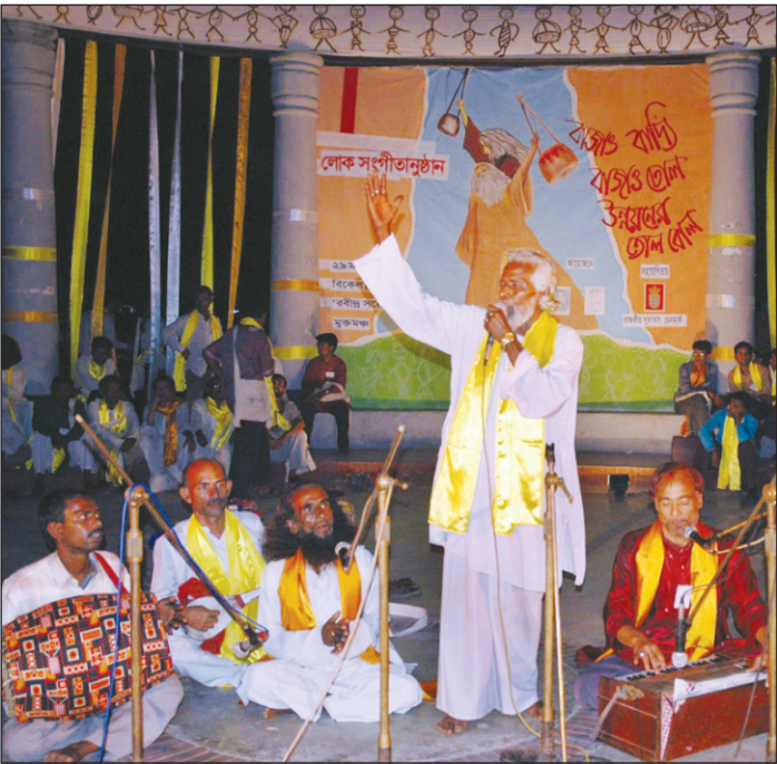
Folk artistes perform at the programme

The programme advanced well into the night with all 64 artistes performing songs.