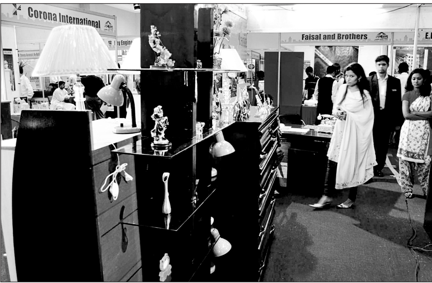
Visitors at a three-day Housing Fair that began at Dhaka Sheraton Hotel yesterday. Bangladesh Real Estate Directory organised the fair.