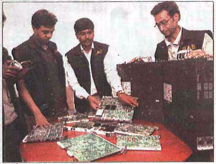
Rapid Action Battalion personnel seize VoIP equipment at Aktel's head office on Gulshan Avenue in the capital yesterday.