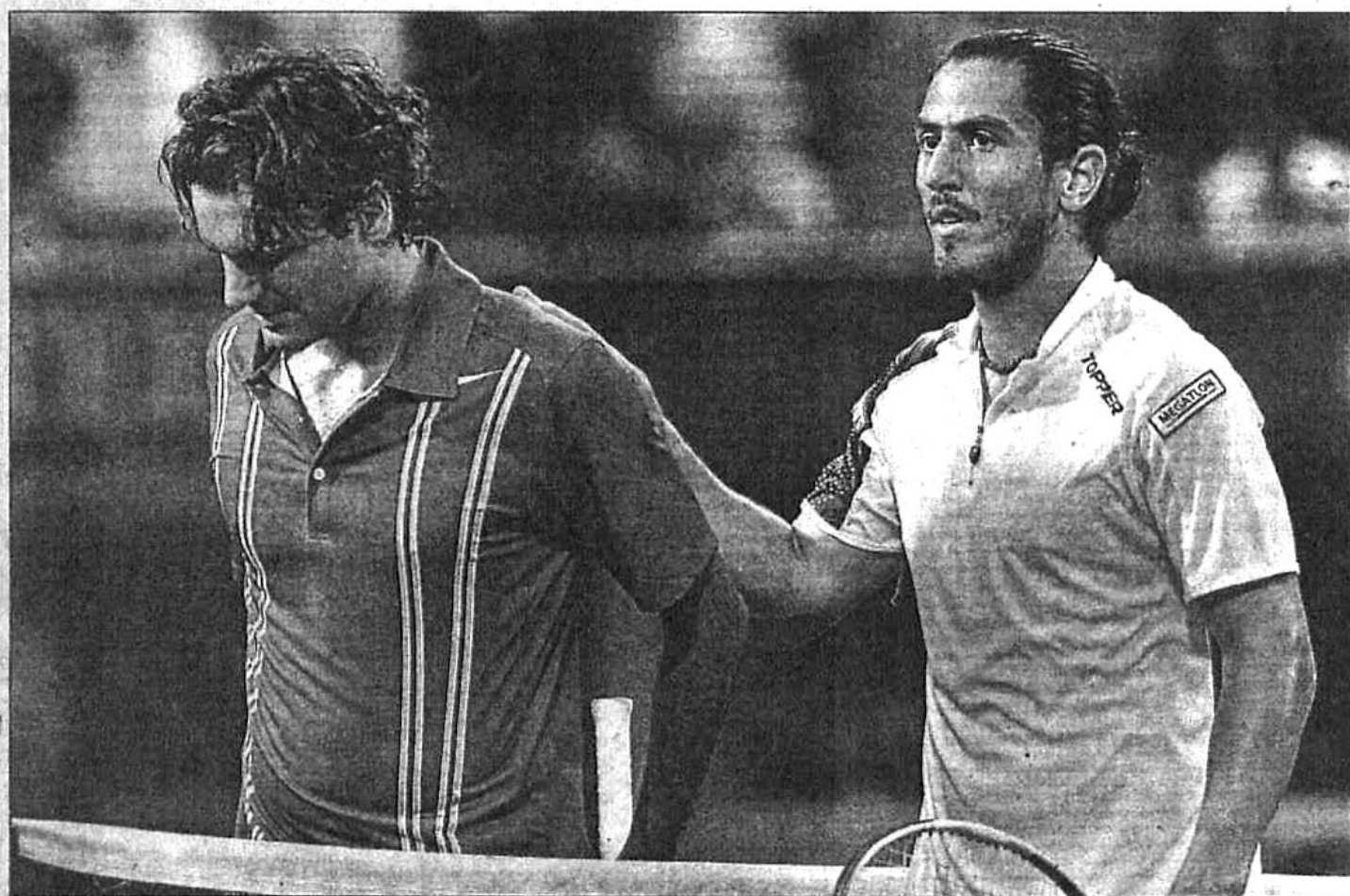
Guillermo Canas (R) pats Roger Federer on the back after defeating the world number one at the ATP Masters Series event Sony Ericsson Open in Miami on Wednesday.