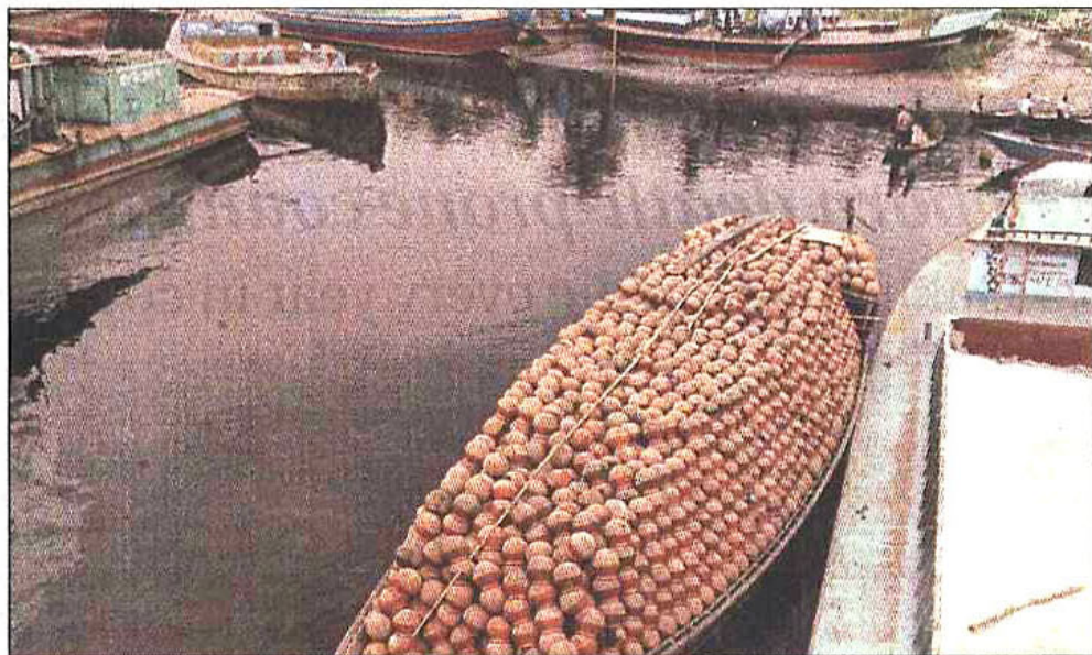
The Devdholai river on the east of the capital is now a nuisance for around 2.5 lakh people of 12 villages as city wastes have dangerously polluted its water, turning it pitch-black and stinky.