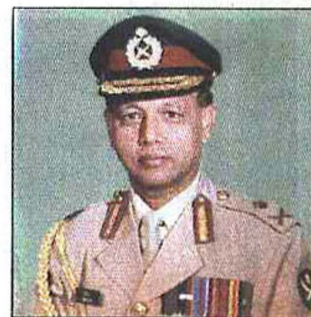
Lt Gen Moeen U Ahmed