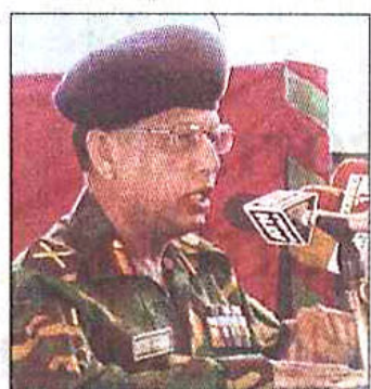
Lt Gen Moeen U Ahmed

national parade on the first anniversary of independence. "In the 36 years since independ-