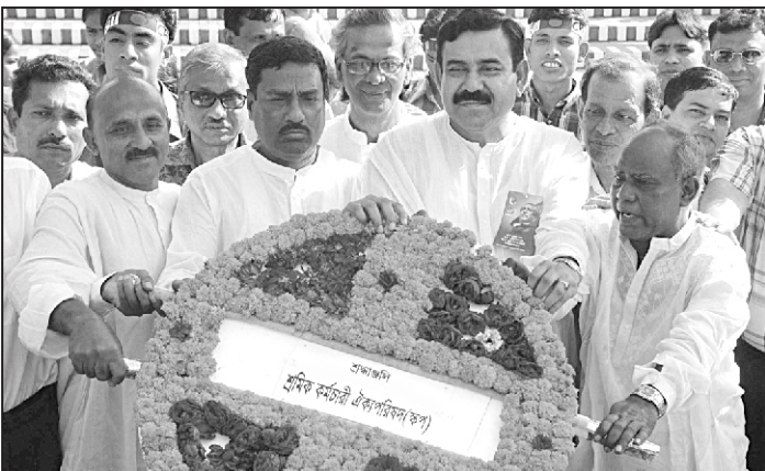
Sramik Karmachari Oikya Parishad