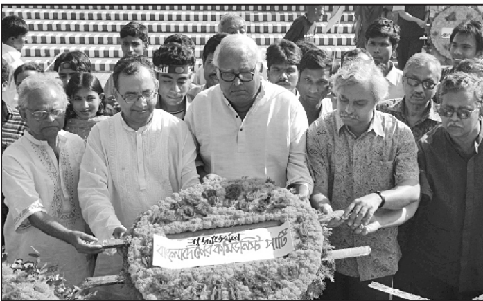
Communist Party of Bangladesh