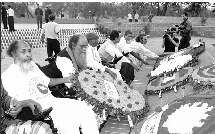
War-maimed freedom fighters