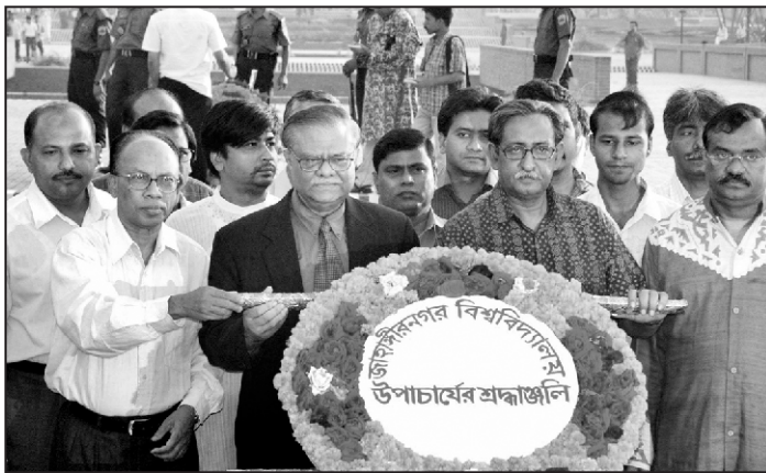
Vice-chancellor of Jahangirnagar University