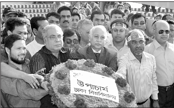
Vice-chancellor of Dhaka University