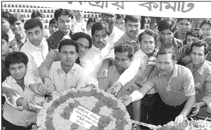
Amra Muktiyoddhar Santan