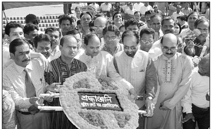
Supreme Court Bar Association