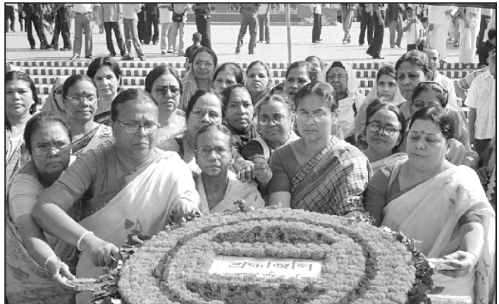
Bangladesh Mahila Parishad