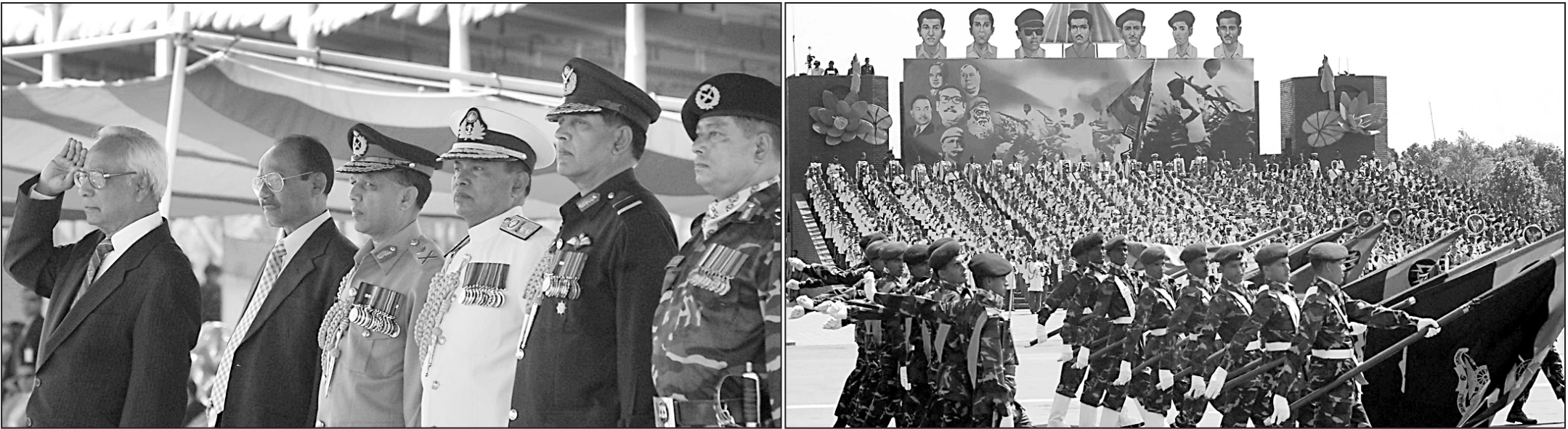
President Iajuddin Ahmed takes salute (left) during the Independence Day parade as members of the armed forces march past (right) at the National Parade Ground in the city yesterday.