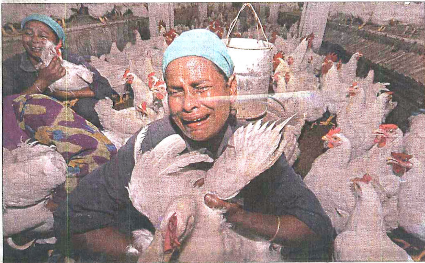
Workers of Bibi Ayesha Poultry Farm at Jirani Bazar in Gazipur break down in tears yesterday as they were asked to destroy all chickens at the farm fearing they might be infected with the H5N1 strain of bird flu.