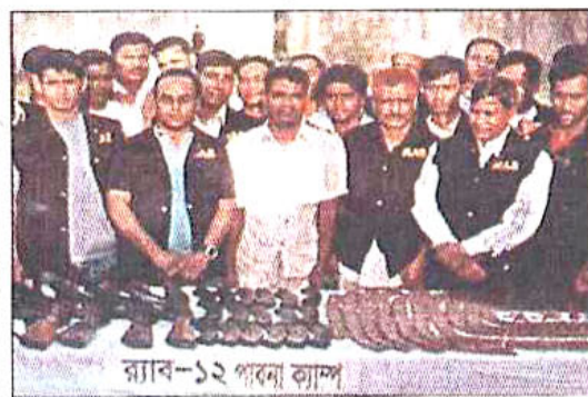
FROM LEFT... Rapid Action Battalion (Rab) personnel recover eight sub machine guns (SMGs) and around 1,500 bullets at Atakula in Pabna yesterday. Another Rab team busts several dens of Jama'atul Mujahideen Bangladesh (JMB) and recovers huge quantity of bomb-making materials and arrest four people in Jamalpur.