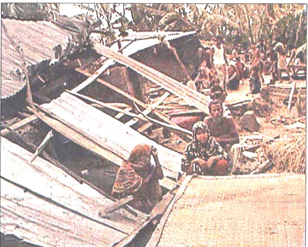
Villagers sit in despair amid the debris of their houses that were destroyed by Thursday night's severe storm at Lalmonohar, Bhola. The storm also lashed Char Borhanuddin, killing at least 10 in the two upazilas.