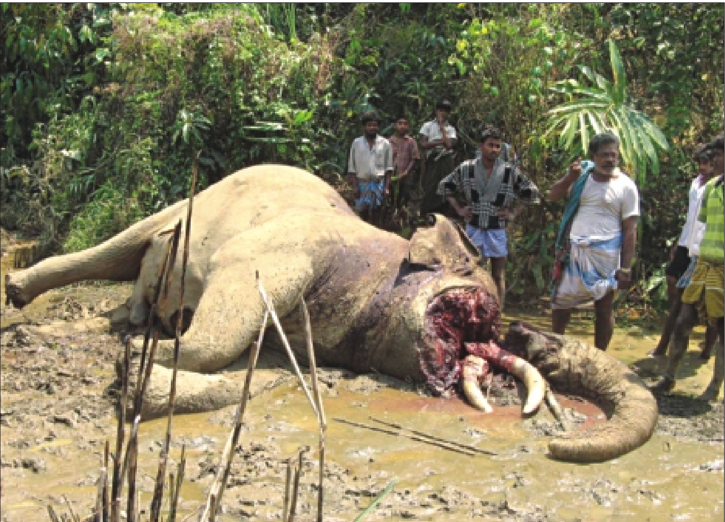
A 100-year-old elephant died in a fight with another lies in Zaliyapalong forest in Cox's Bazar.