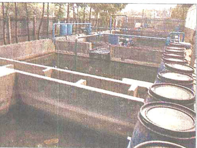
Effluent Treatment Plant (ETP), left, of Pakija Dyeing and Printing Ltd. The factory was fined yesterday for polluting water of adjacent Bangshi River, right, by keeping the ETP turned off.