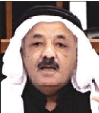
Taha Yassin Ramadan

Saddam Hussein's former vice president was hanged for crimes against humanity early yesterday, the fourth anniversary of the US-led invasion that toppled Saddam Hussein from power. Former Vice President Taha Yassin Ramadan was the third of Saddam's top aides to be hanged since the ex-president was executed in December after a trial in a US-backed Iraqi tribunal that was criticised by human rights groups as unfair. The executions have done nothing to subdue violence that has