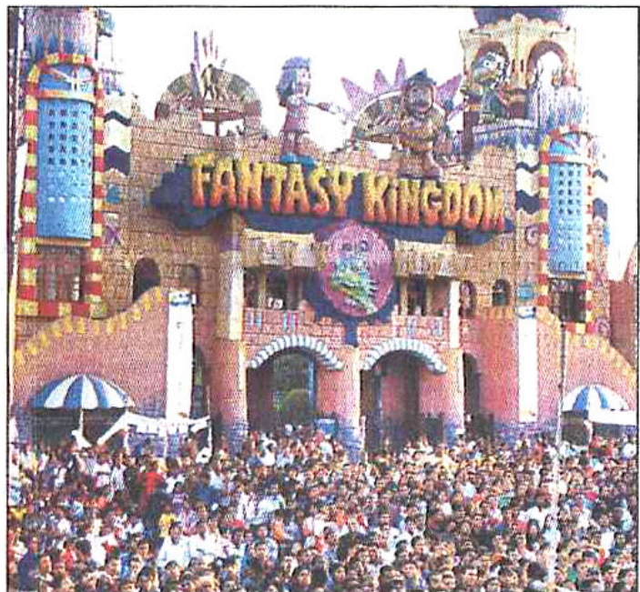
Enthusiastic visitors throng the Fantasy Kingdom at Ashulia