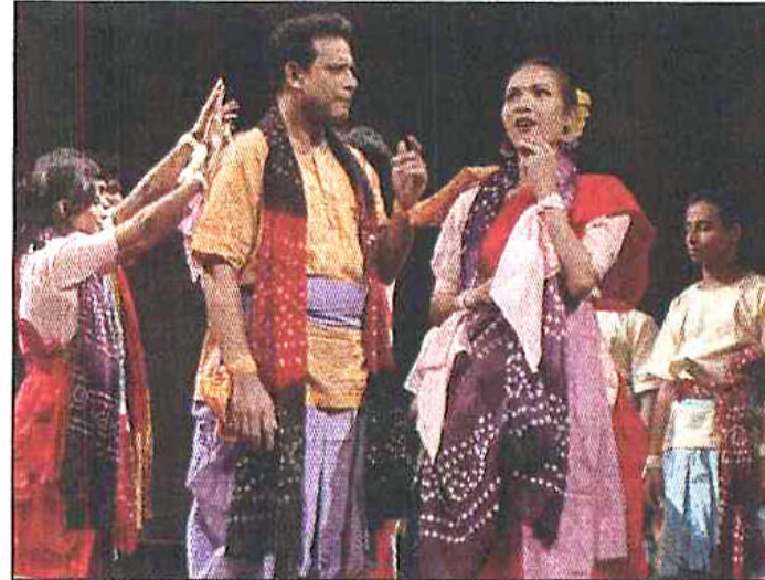
Actors perform in Sonar Boron Koinna

The keynote paper reads that the theatre activists themselves are creating turmoil while making efforts to apply the traditional