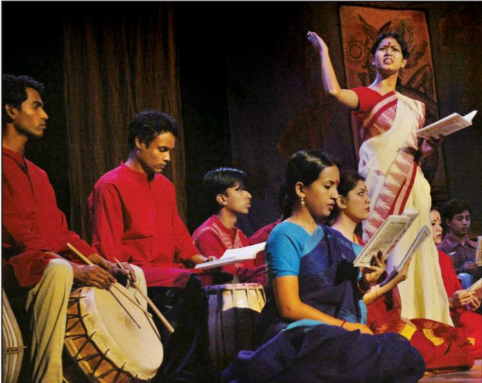
Recital of Nimajjon

Acclaimed dramatist Selim Al Deen's play Nimajjon is yet to be staged. As part of the script reading course MA students of the Department of Drama and Dramatics, Jahangir-nagar University recite scripts of plays on the stage.