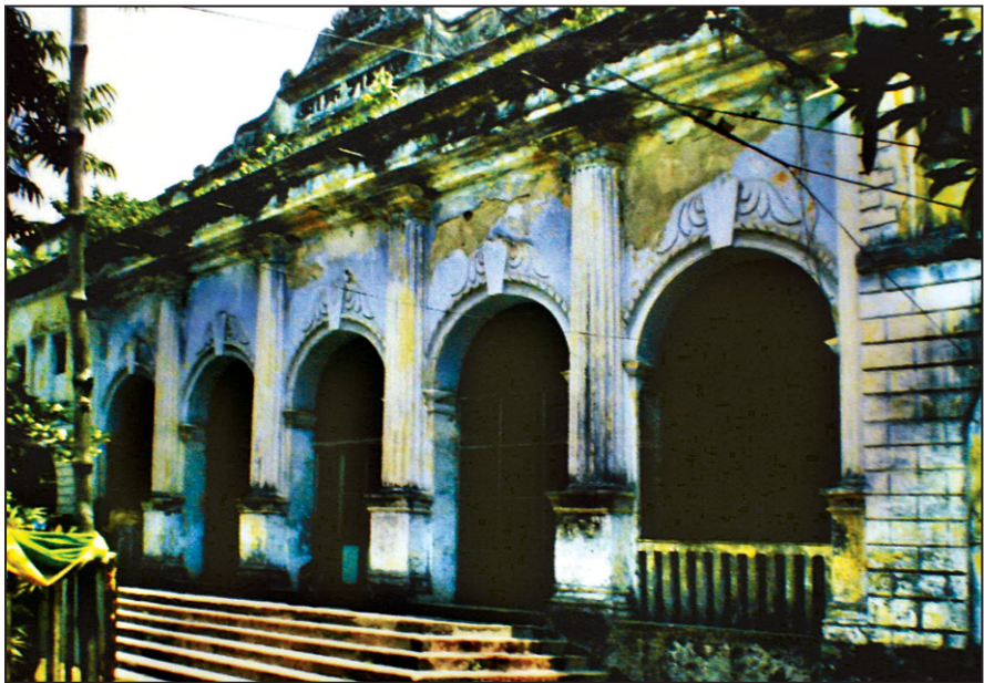
One of the buildings used by Brahma Samaj