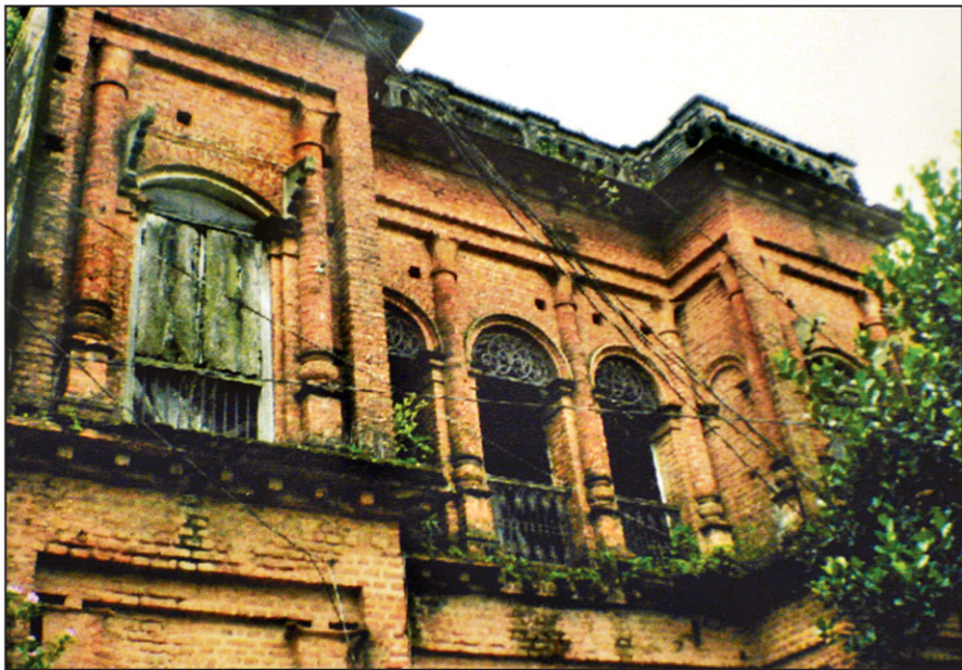
A house in Old Dhaka desperately in need of restoration

three areas: Bahadur Shah Park (originally known as Victoria Park), Panamnagar in Sonargaon and Shankharibazar.