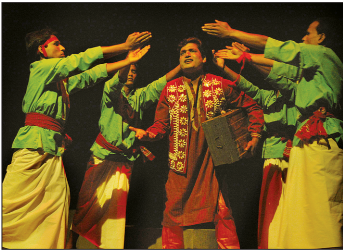
A scene from Shundar Alir Pala