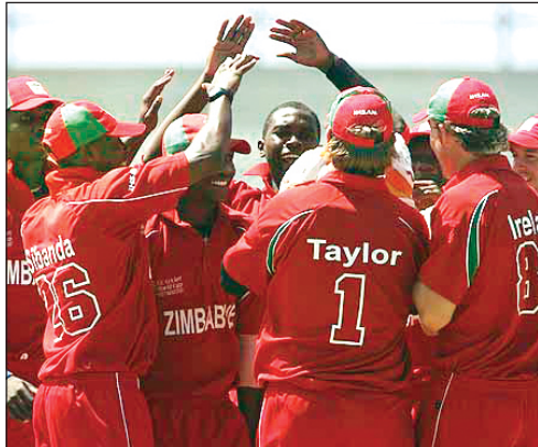
ICC World Cup 2007 On BTV at 8:15pm Zimbabwe Vs Ireland Live from Jamaica

08:40 Shuprovat Bangladesh 09:30 Chokh Mele Dekhi 10:00 Shulela Lagan 10:30 Bangla Feature Film 02:00 Show Case 03:30 Drama Serial: Ghughur Basha 04:30 Baker Pathay 05:15 Gollachhut 06:00 Saaj Bela 06:45 Mukti Judho 07:00 Olpo Sholpo Golpo 08:15 Drama Serial: Dokhinayon Society 09:00 Drama Serial: Nokol