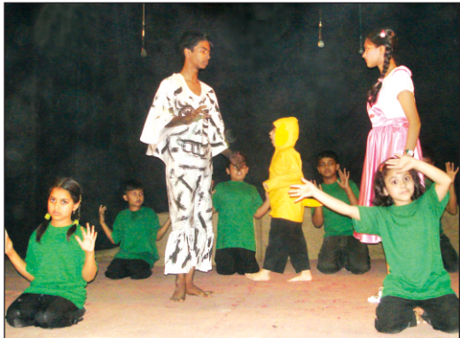
Young actors perform in Oz-er Jadukar

Chorobeti Children's Theatre School (CCTS) staged Oz-er Jadukar ( The Wizard of Oz ), recently. A timeless classic by L Frank Baum, the central theme is the adven-