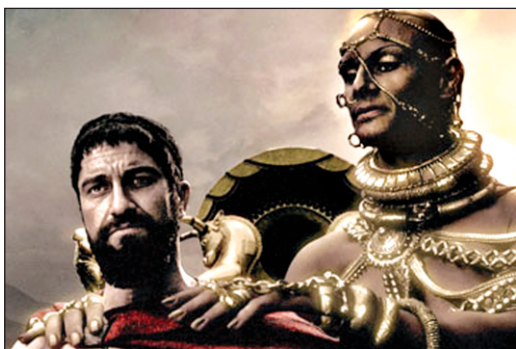
Gerard Butler (L) as King Leonidas and Rodrigo Santoro as King Xerxes in 300

The movie comes at a time of increased tensions between the United States and Iran over the Persian nation's nuclear program and the Iraq war.