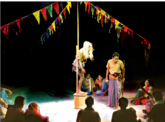
A scene from Bibhajon

As part of the ongoing National Theatre Festival arranged by Bangladesh Group Theatre Federation in association with Bangladesh Shilpakala Academy, Sarathi Natya Sampradaya from Rangpur staged Dudhkumarar Pala on March 13.