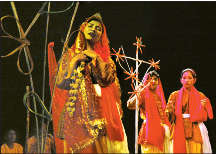
Actors of Sarathi Natya Sampradaya stage Dudhkumarar Pala

When the child, Dudhkumar, becomes a 20-year old youth, he falls in love with Kanchanmala, the princess of another kingdom. When Dudhkumar goes there to marry her, he encounters numerous obstacles.