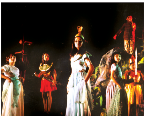
Students of Scholastica in one of the plays