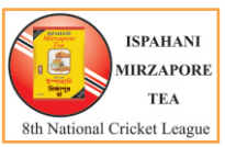
Ispahani Mirzapore Tea 8th National Cricket League

Dramatic batting collapses saw eighteen wickets tumble on the second day of the Ispahani Mirzapore Tea 8th National Cricket League match between Dhaka and Khulna at the Fatullah Cricket Stadium yesterday.