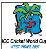
ICC Cricket World Cup WEST INDIES 2007

St Kitts and Nevis are basking in the glory of hosting the World Cup even if it means finding themselves at the centre of a high-stakes, geo-political game.