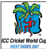
ICC Cricket World Cup WEST INDIES 2007

Bangladesh at the Queen's Park Oval here on Saturday.