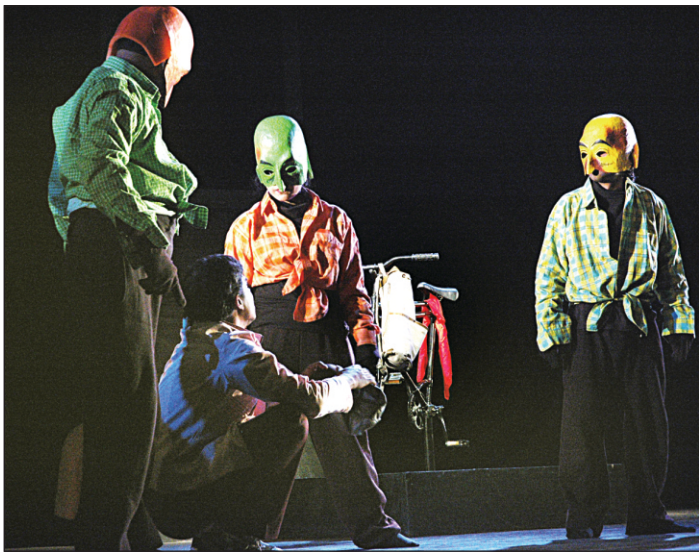
Actors of Tirjak Natya Goshthi in Sattandha

Like other such plays, the turmoil in politics and law enforcement agencies has been featured in Sattandha . But, the unique feature of the play is the oppression of the ethnic minorities by Bengali majority. The irony is that while most people bemoan the oppression of the Palestinians and Iraqis by the Israelis and Americans respectively, the average Bengali is blissfully unaware of the marginalisation of the ethnic minorities in Bangladesh.