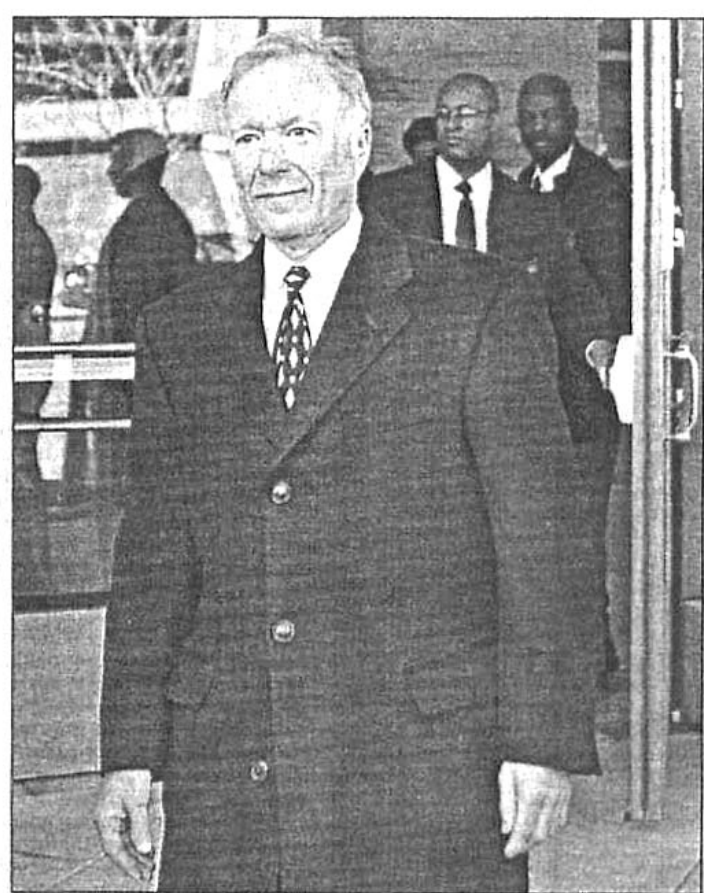
Lewis "Scooter" Libby, walks out of federal court after the verdict Tuesday.