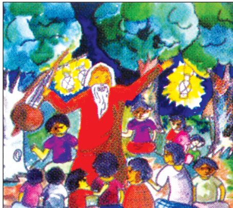
Artworks on rural lifestyles, fairs and festivals on display