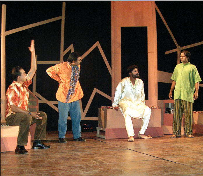
Scenes from Raja-Rani (Top) and Rater Otithi

Due to unavoidable circumstances, instead of the scheduled Anirban Theatre (Darshana, Kushtia) production Muchiram Gunr , Theatre Centre's production Rater Otithi will be staged. Utpal Dutta's play Rater Otithi is a social satire on corruption. Be it politics, business, media, literature, even social work, corruption seems to have crept into every sphere of life in the country. Utpal