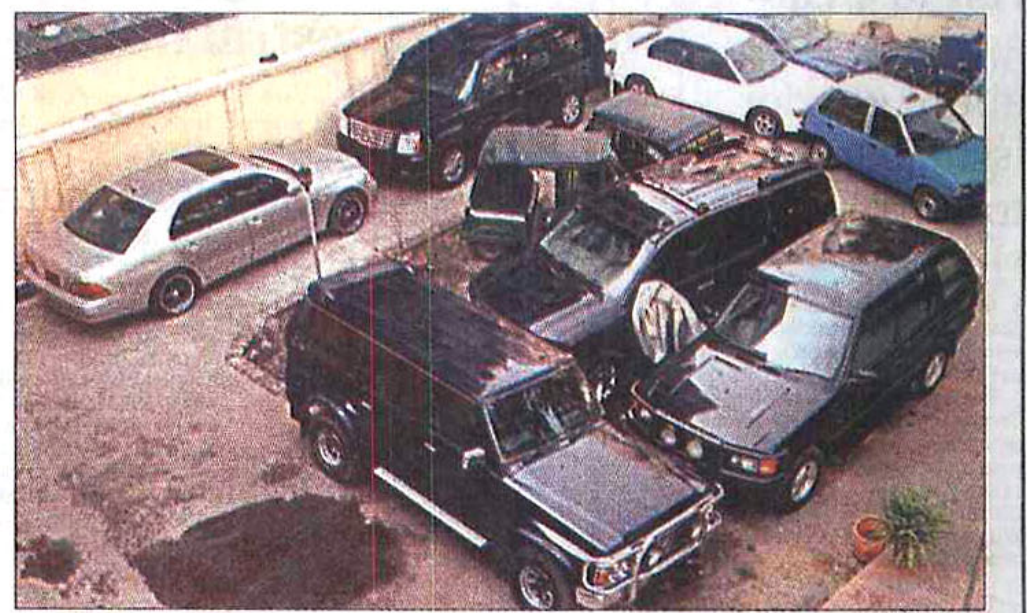
Dhanmondi Police Station in the capital turns into a mini parking lot of expensive cars as seized vehicles of three high-ranking BNP leaders are kept there.