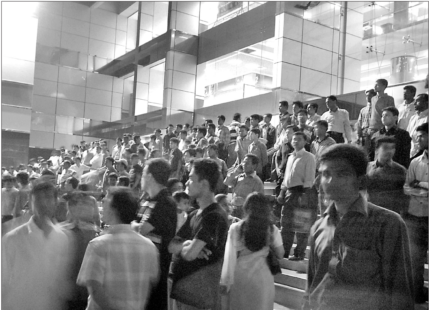
Shopkeepers coming out of the Bashundhara City shopping mall in the evening following shutdown at 7pm.

by-lanes, however, remained open. Rationing succeeded in reducing current load to some extent. According to the DESA control room at Katabon the shutdown has saved around 60 MW electricity per day in its area, whereas DESCO central control room at Bashundhara confirms around 40 MW. A high official from the National Load Dispatch Centre of Power Division, Ministry of Power, Energy and Mineral Resources corroborated the information. He said that in Dhaka city the shutdown is saving around 100 MW per day.