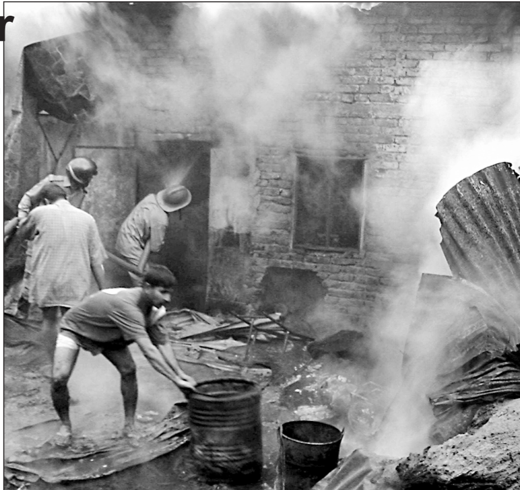
Fire fighters try to extinguish a fire at Power Mosquito Coil Factory at Shanir Akhra in the city yesterday.