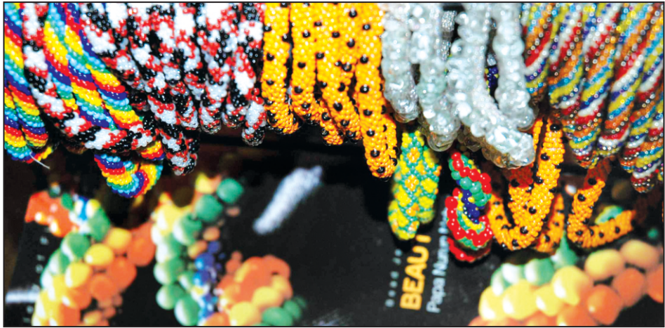
(Clockwise) Models display eye catching bead jewellery and a few selected items

Elements of folk art have been combined with modern flavours in Nurun Nahar's creations. The designs are detailed and imaginative. "The jewellery is not just to adorn but to rekindle aesthetic pleasure," the artist says.