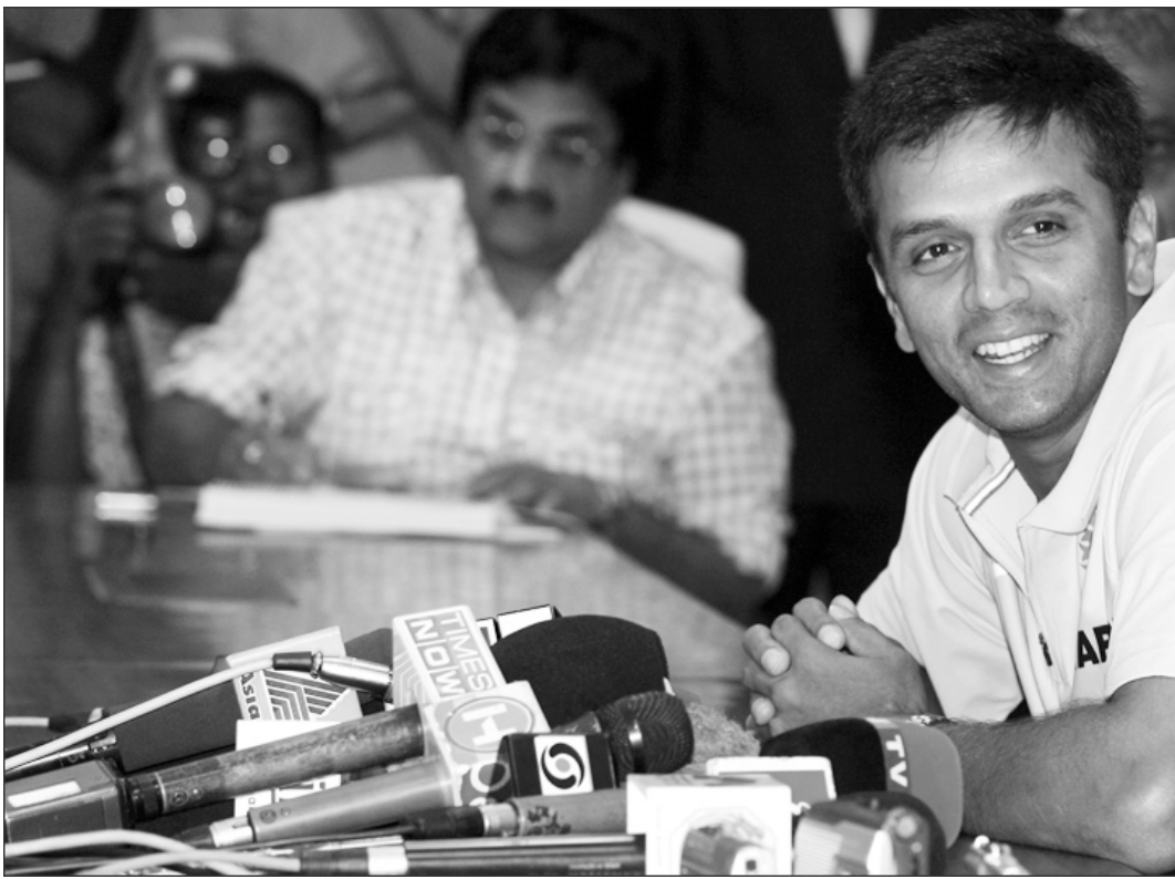
Indian cricket captain Rahul Dravid (R) speaks at a press conference in Mumbai in connection with the Cricket World Cup yesterday.

KHULNA: 254 all out in 94.4 overs (Monirul 56, Hasan 14, Imrul 0, Nahidul 5, Manjarul 9, Jamaluddin 103, Montasir 19, Salim 16, Kabir 5, Mahmood 0, Shibli 0 not out, extras 27; Sharif 2-53, Kapali 3-48, Saif 1-13, Nabil 4-71).