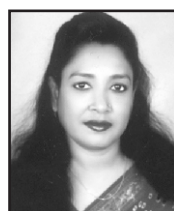
Biman, says a press release.

On the occasion, a doa mahfil will be held at Sonargaon Road mosque in the city after Asr prayers today.