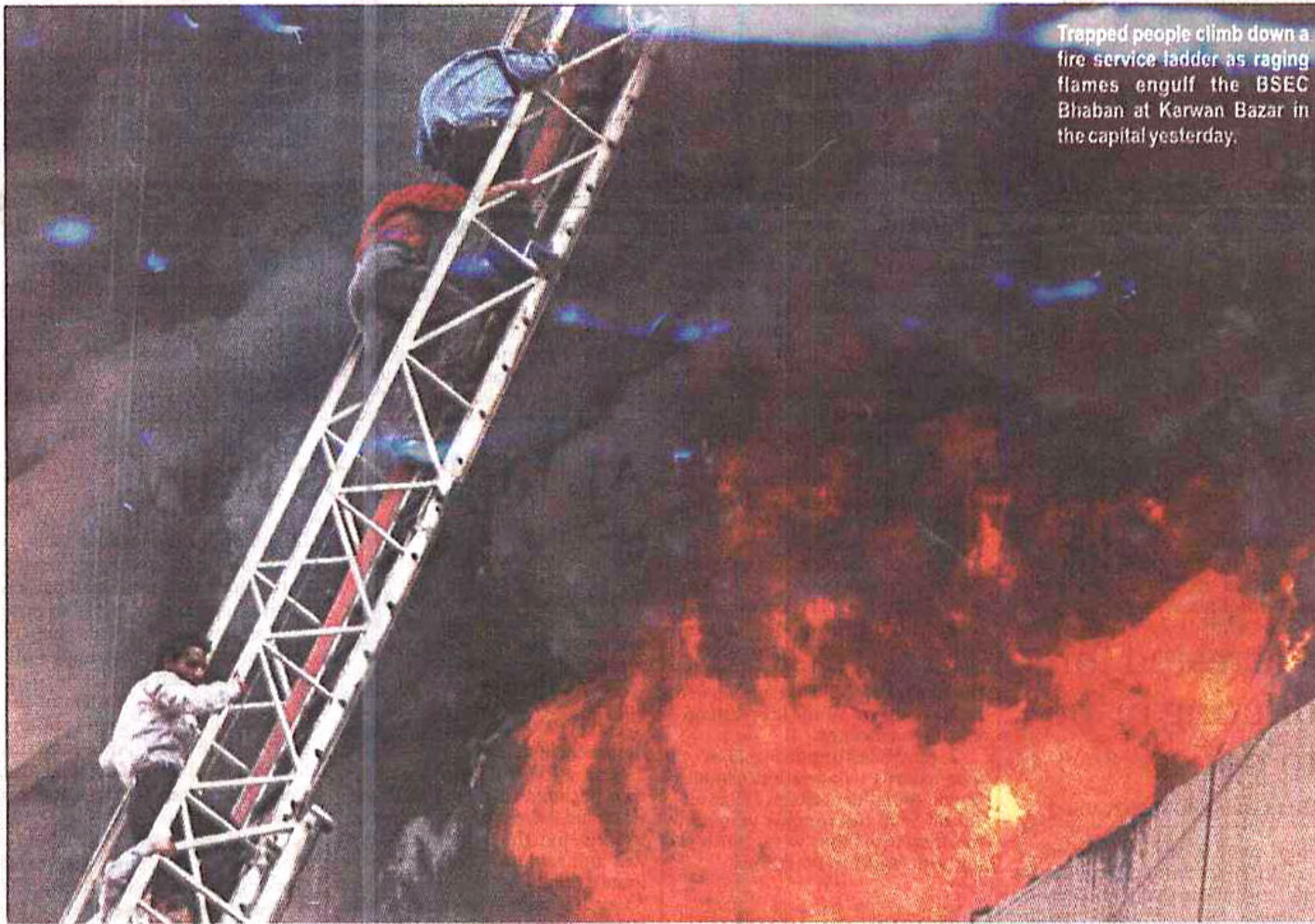
Trapped people climb down a fire service ladder as raging flames engulf the BSEC Bhaban at Karwan Bazar in the capital yesterday.