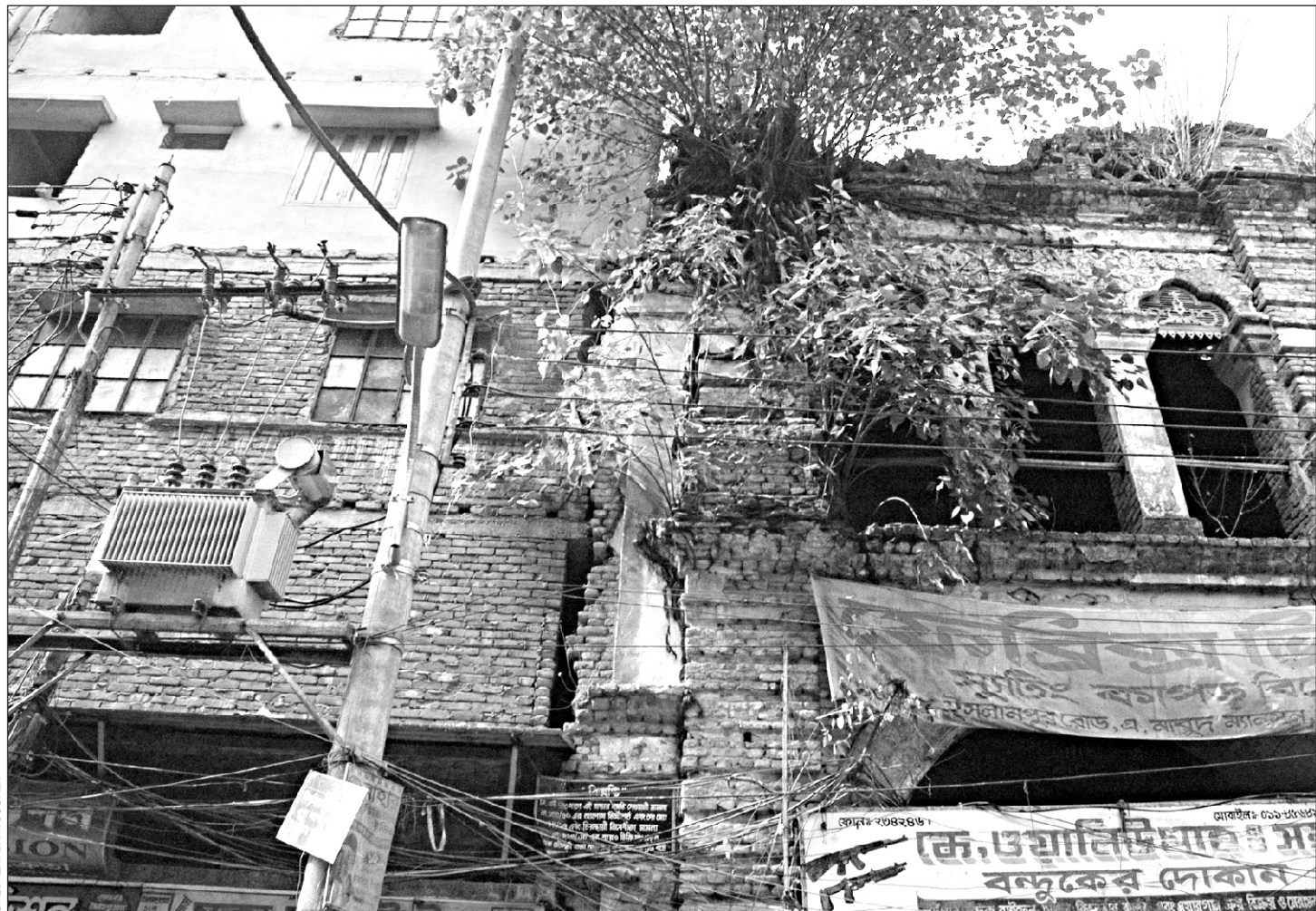
SYED ZAKIR HOSSAIN

PPI was highly praised in the 3rd World Water Forum 2003 held in Kyoto, Japan.