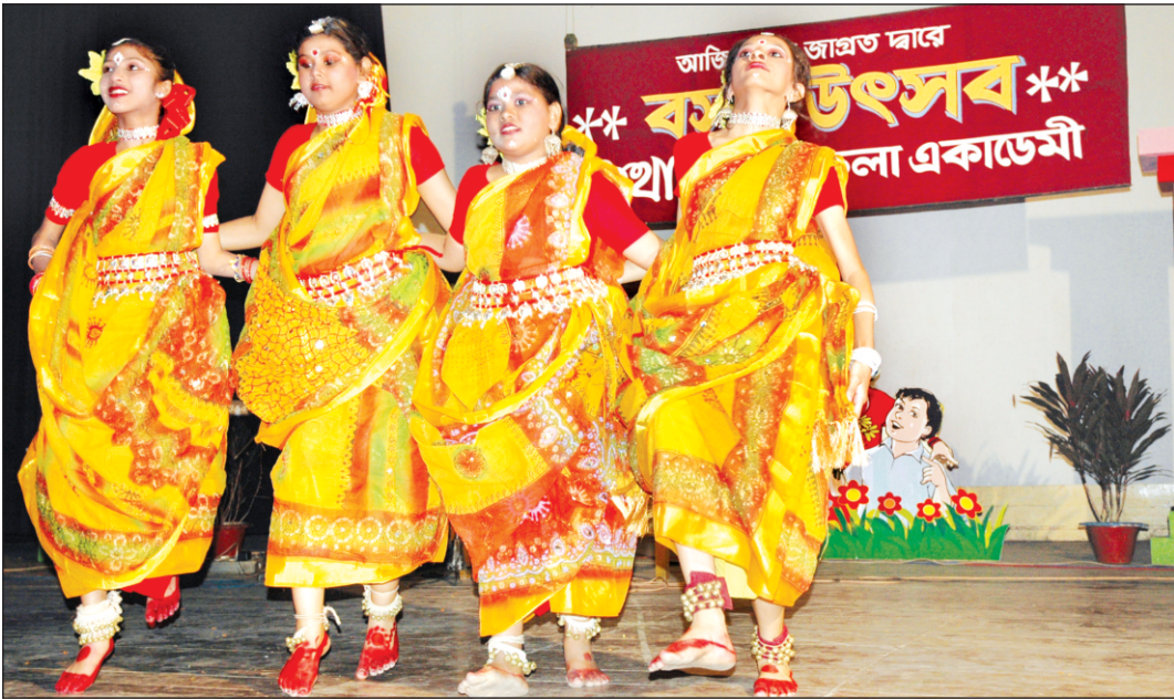
Young dancers perform at the event

Altogether 26 performances were staged at the well attended programme.