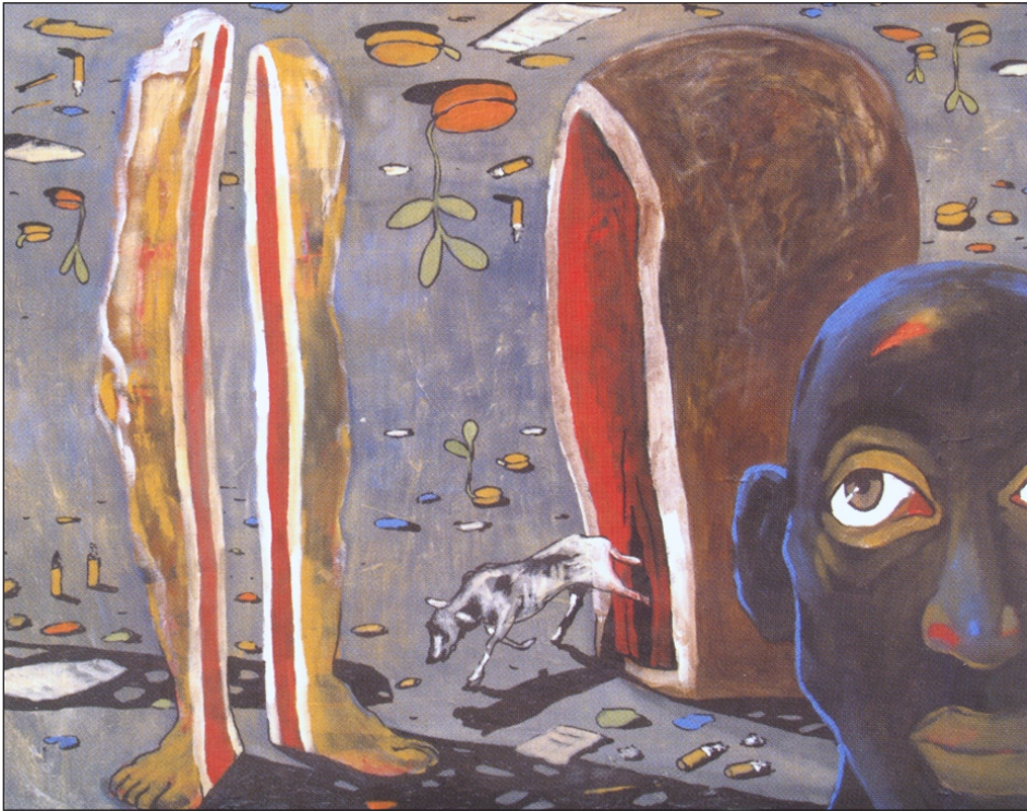
Barongbar (acrylic) by ASM Rashidul Alam Manik

Barongbar 1 and Barongbar 2 are two acrylic