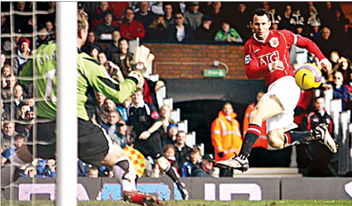
Manchester United winger Ryan Giggs (R) scores a stunning equaliser against Fulham during their Premiership encounter at Craven Cottage on Saturday.