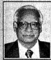
Professor Dr. Iajuddin Ahmed President People's Republic of Bangladesh

Message from the Honorable President, People's Republic of Bangladesh and the Chancellor, American International University-Bangladesh (AIUB)