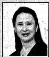
VICE CHANCELLOR American International University- BANGLADESH

Message from the Vice Chancellor, American International University-Bangladesh (AIUB)