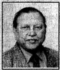
FOUNDER-CHAIRMAN American International University- BANGLADESH

Message from the Founder-Chairman, American International University-Bangladesh (AIUB)