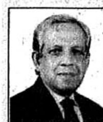
Dr. Fakhruddin Ahmed Chief Adviser Government of the People's Republic of Bangladesh

Message from the Honorable Chief Adviser, Government of the People's Republic of Bangladesh