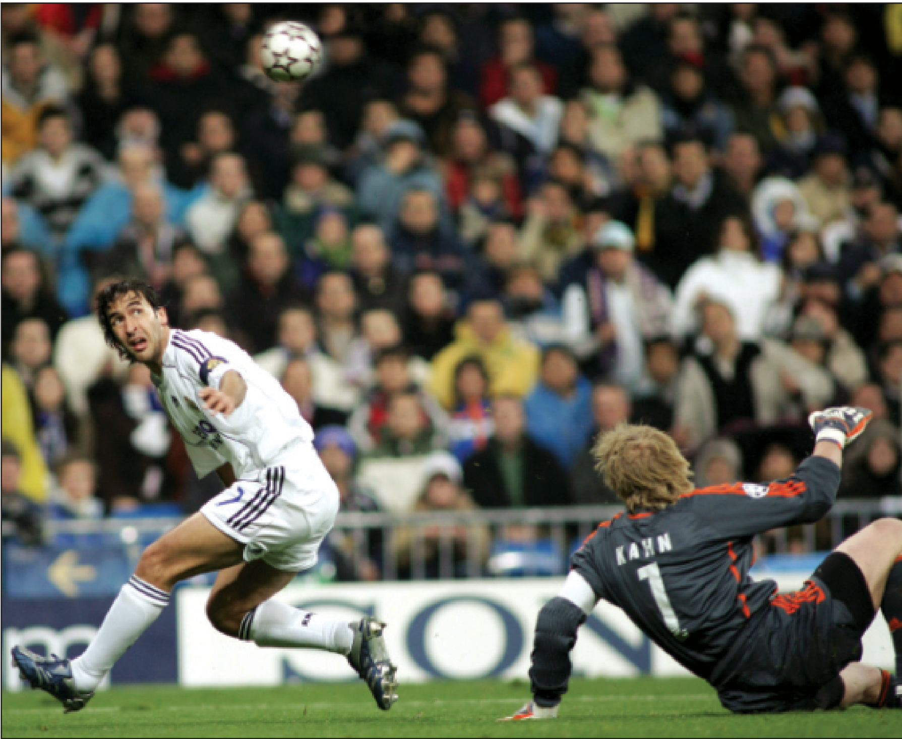
Real Madrid forward Raul (L) watches the ball drop for an easy tap in after beating the sprawling effort of Bayern Munich goalkeeper Oliver Kahn during their Champions League clash at the Santiago Bernabeu on Tuesday.

Pizarro should have pulled it back to 3-2 with 12 minutes remaining, Iker Casillas making a superb reaction stop diving to his left, before Van Bommel's powerful strike left him helpless.