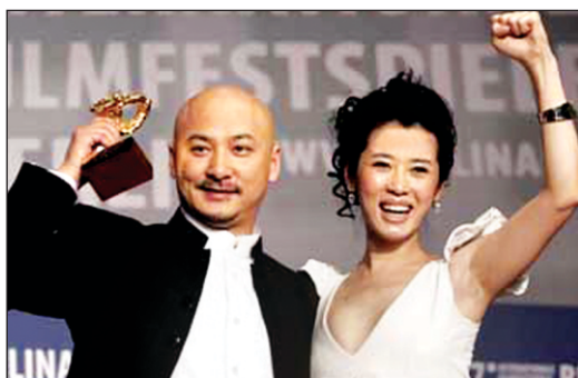
Director Wang Quan'an and actress Yu Nan of Tuya's Marriage pose with their Golden Bear