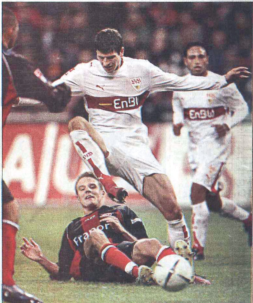
Stuttgart shooting star Mario Gomez (top) hurdles over the challenge of Frankfurt midfielder Alexander Meier during their Bundesliga clash in Frankfurt on Friday.