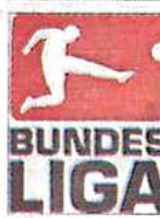
Glassy VfB Stuttgart

strengthened their claims to a Champions League place with a 4-0 win at Eintracht Frankfurt on Friday.