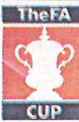
replay at Ewood Park.

The Gunners pressed hard throughout and carved out nearly all of the game's chances, but they could not break down Blackburn's resistance.