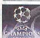
Refreshed by a sunshine break in Portugal, Liverpool's strikers are in the mood to cut Barcelona's

feuding superstars down to size in the Nou Camp on Wednesday.