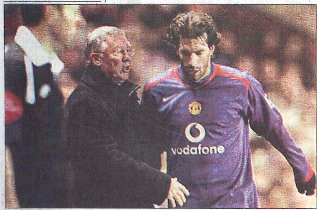
Ferguson (L) and Ruud van Nistelrooy in happier days...