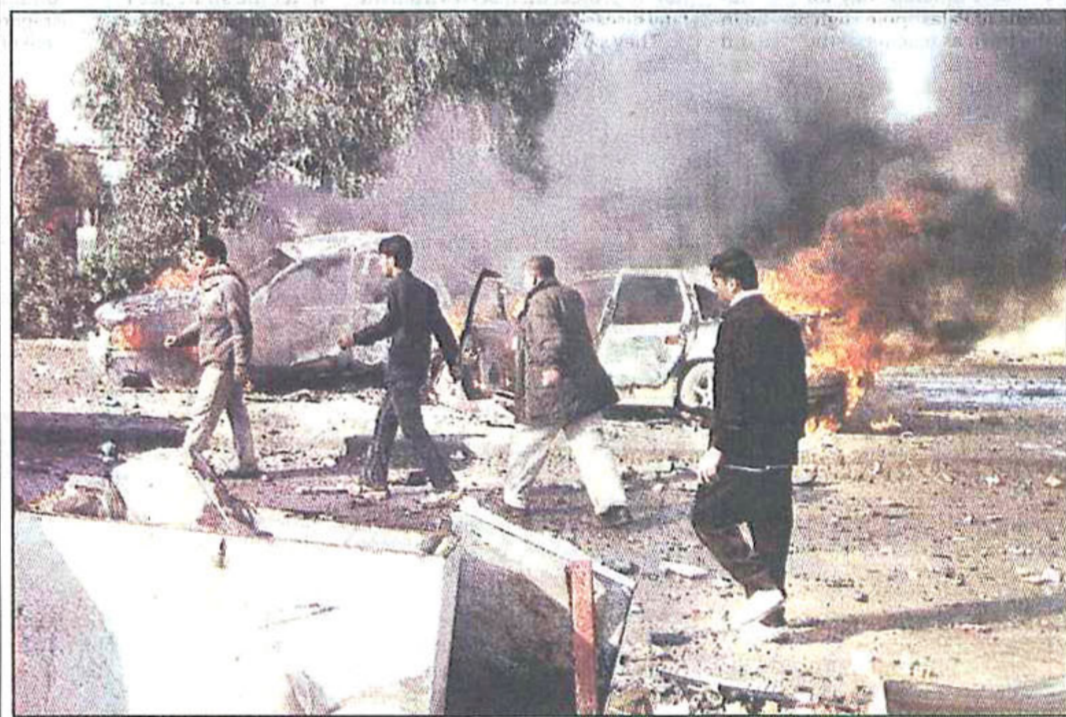
Iraqis rush to the site where two car bombs exploded in quick succession at a garage in the oil rich city of Kirkuk, north of Baghdad yesterday. Ten people were killed and 48 others were wounded in the blast according to police sources.