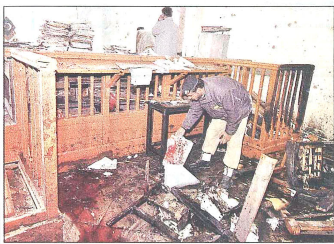
A Pakistani policeman looks at bloodstained documents scattered on the floor of a court after a bomb blast in Quetta yesterday. At least 15 people were killed and dozens injured when a powerful bomb exploded near a court in Pakistan's southwestern city of Quetta.

Some experts have previously proposed a "grand bargain" by which the US and its allies could defuse North Korea's military threat through its reforms and weapons cuts in exchange for more aid.