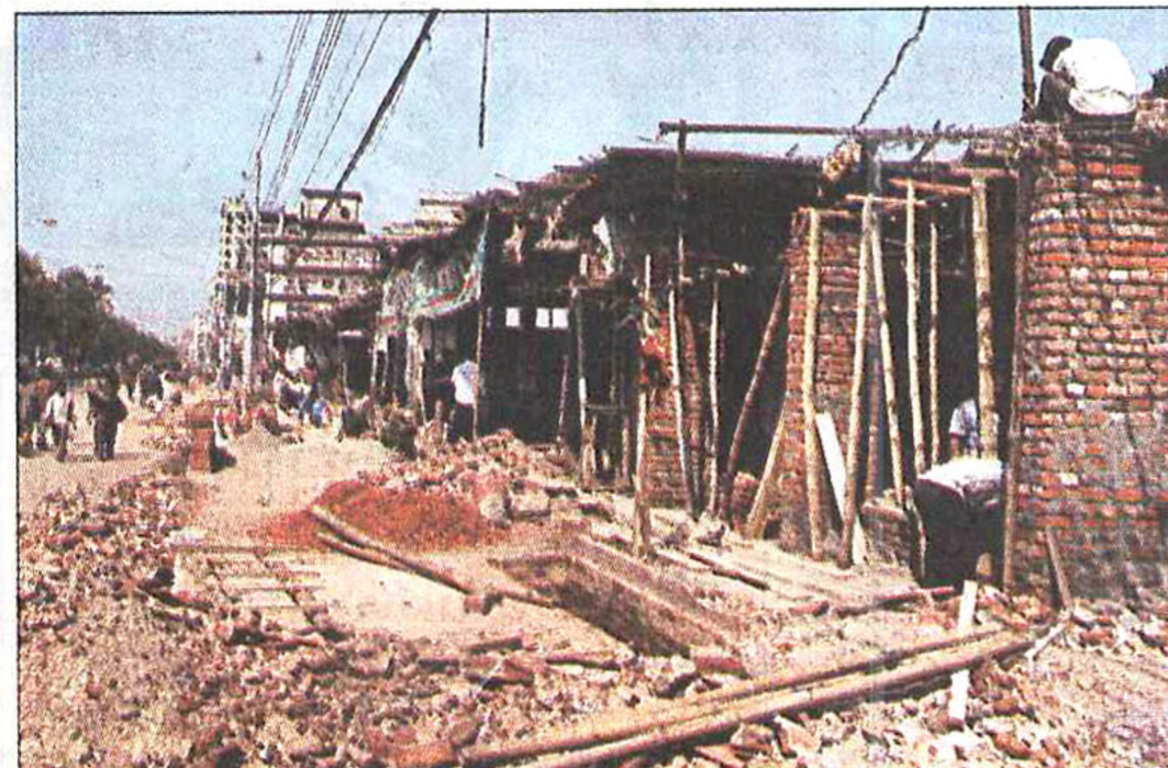
Owners themselves dismantle and restructure their shops at Sheorapara in Mirpur as drive to remove illegal structures continued in the city yesterday.

The authorities concerned have been asked to be careful so that the poor and the destitute do not suffer from such eviction drives.